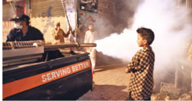
Fumigating a Pakistani city to kill dengue-transmitting mosquitoes

In order to get flightless females, James actually engineered male skeeters instead. The transgenic (genetically engineered) males mate with females and pass on their extra genes to their offspring. Any female mosquitoes born to those fathers are unable to fly and, therefore, unable to mate. As the genes spread, the population dwindles. "The idea is to get a zero population," James says.