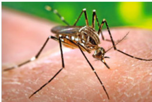
A female Aedes aegypti mosquito

If you happened to be on the island of Grand Cayman not long ago, you needn't have bothered. In a test on the island, scientists released millions of lab-created mosquitoes. The insects were engineered to self-destruct. No need for swatters.